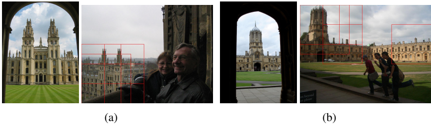
Figure 1: This figure shows two challenging examples with backgrounds and clutters in Oxford5k. In each example, the left is a query, while the right is its corresponding positive image. We mark top five attentive regions of our regional attention network in the positive images as red boxes.

To avoid newly fine-tuning the network depending on target categories of images, we encode images into compact feature vectors using an off-the-shelf CNN, commonly known as a general feature extractor. In this context, we set a target type of this work to the "pre-trained single-pass" category of CNN-based approaches, defined by Zheng et al. [60] for efficient and accurate image retrieval.